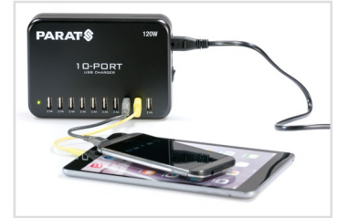
PARAPROJECT MC10 Multi Charger Art.-No. 990.555.999